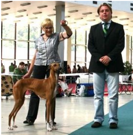
Brno INTERCANIS 2008

To describe this breed, I refer to the very good official [FCI] standard ( in Italics ), and present my writing as a letter from a breeder and an Azawakh judge to his colleagues. I write this, not only thinking about the future of the breed, but also to the judges desirous of understanding what an Azawakh is, and how we should judge this uncommon beauty to preserve its uniqueness. I have not found it necessary to dwell on the obvious aspects, but rather to emphasize the important points that make the difference between a good judge and a great judge.