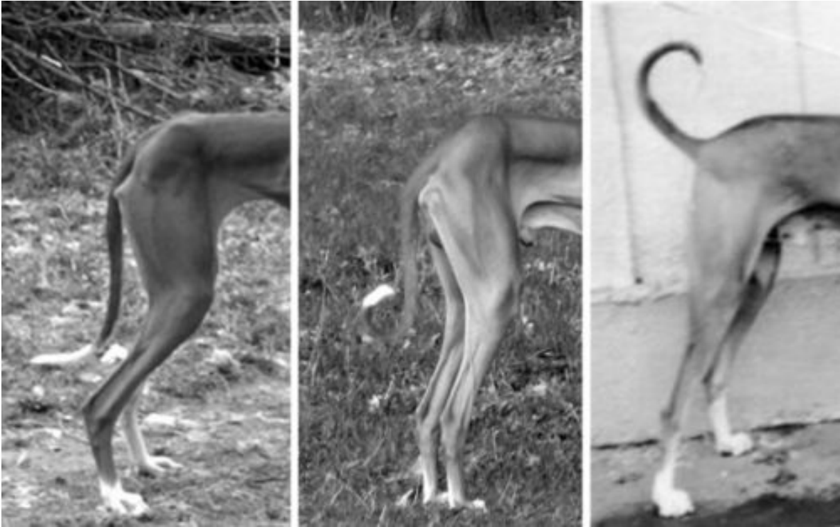
Photo 9: Too Pronounced Angulations / Photo 10: Correct Angulations / Photo 11: Straight Angulations