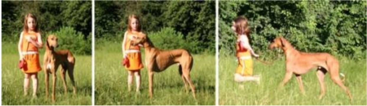
Photo: the same dog that obeys a very little girl here, never accepts being touched by strangers. As long as it is an excellent partner for every member of its family, and can be correctly presented in a ring, its distrust should not be considered a fault but ... a quality.