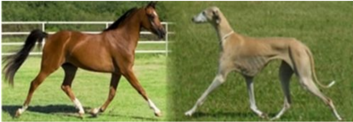
Photo 1a/1b Similarities Between The Arabian Horse And The Azawakh